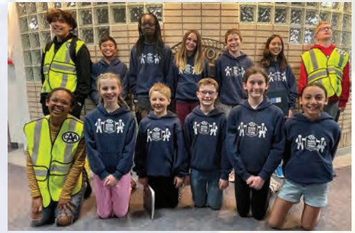
Patrollers at St. Paul's School in Yorkton

CAA Saskatchewan has coordinated and managed the CAA School Safety Patrol program since 1951. CAA Saskatchewan supplies training materials, stop paddles, reflective vests and other supplies free of charge to all registered CAA Saskatchewan School Safety Patrols. Caps and toques are available to purchase. Patrollers are trained annually through a formal program provided by CAA Saskatchewan with assistance from local police before participating in the program. For more information or to start a patrol at your school, visit caask.ca/patrollers or email schoolsafetypatrol@caask.ca .